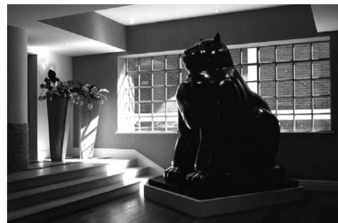
The Soho Hotel: Venue for the "Memories in the House" public art installation by Martin Firrell.

"Memories in the House" is an installation in the public spaces and selected guest rooms of London's Soho Hotel. The hotel, which has been open for just over a year, has been described as the most glamorous hotel in the world, boasting the globe's most luxurious hotel suite.